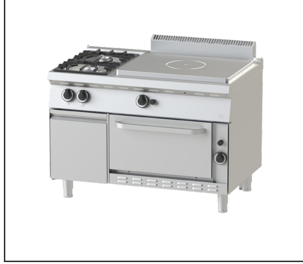
Due to continuous technical development, the image shown may not represent the latest design of the unit.