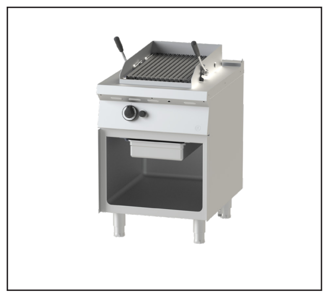
Due to continuous technical development, the image shown may not represent the latest design of the unit.