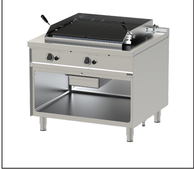
Due to continuous technical development, the image shown may not represent the latest design of the unit.