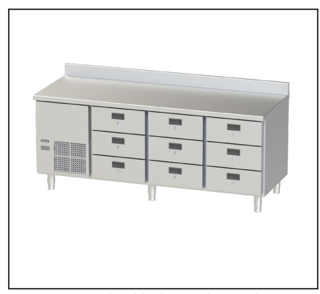
Due to continuous technical development, the image shown may not represent the latest design of the unit.