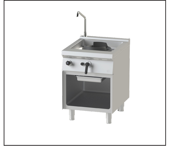
Due to continuous technical development, the image shown may not represent the latest design of the unit.